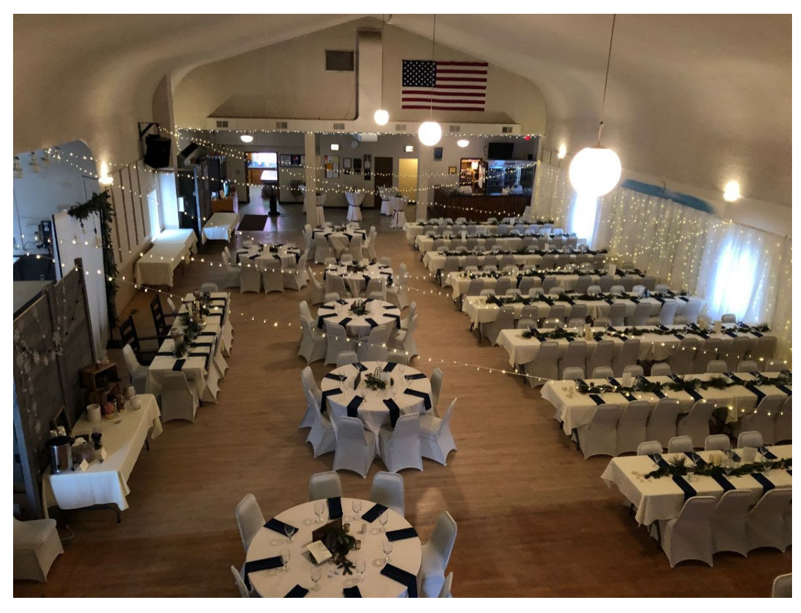
The Concordia is open for rental for private events. Bookings for 2021 and 2022 are going fast!