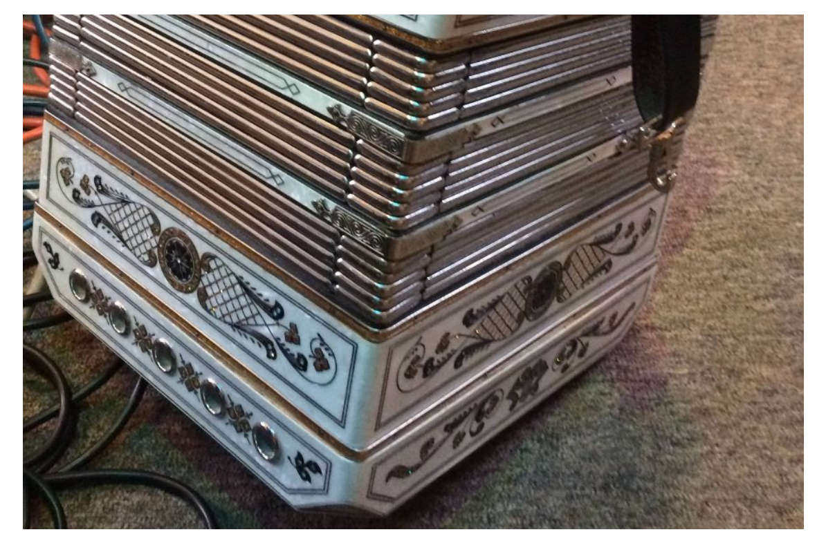
Concordia Annual Polkafest July 10, 2021, 1-5 pm

Mark your calendar for the Concordia's annual Polkafest! We'll be serving brats and fixings, with a cash bar. More information coming soon; stay tuned!