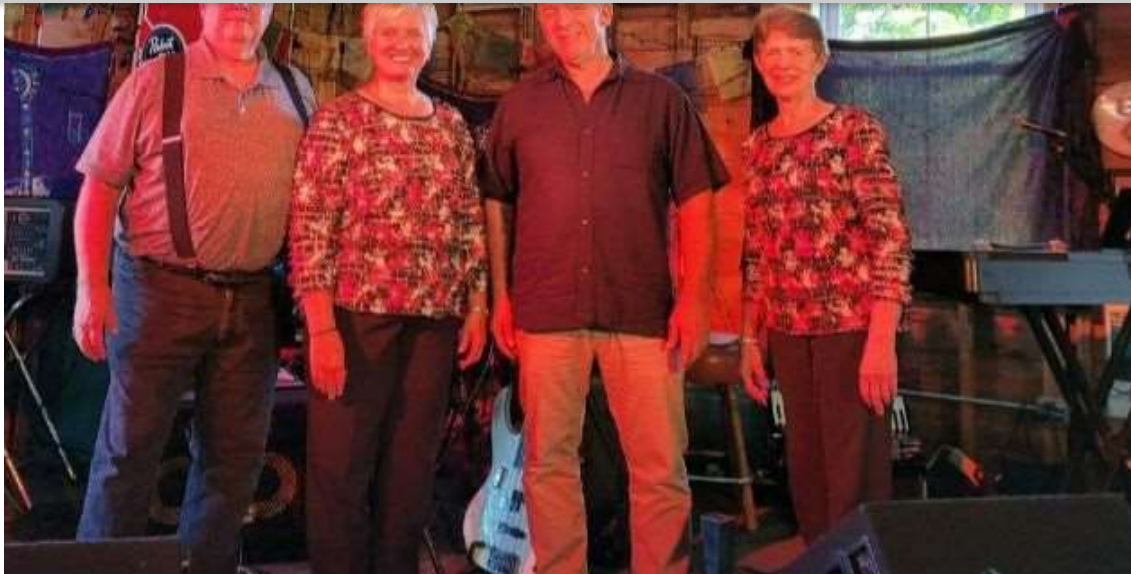
Leather 'N Lace September 3