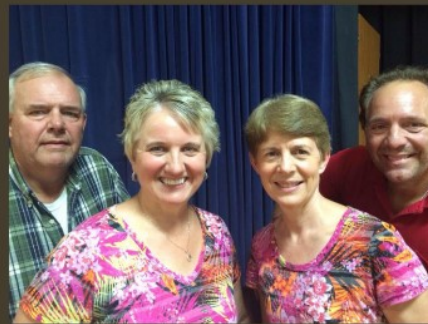
Leather 'N Lace March 27