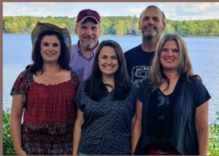
Daddy's Girls March 20