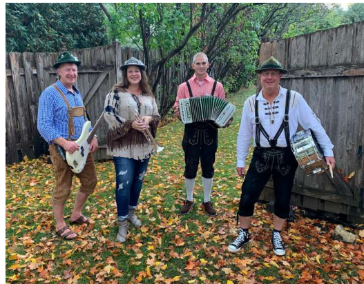
DECEMBER 14th The iPolka Band