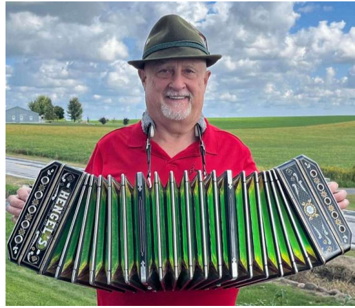
November 30th Ray's Jolly Chaps