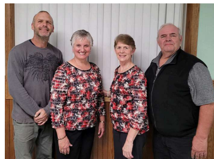
DECEMBER 28th Leather N' Lace