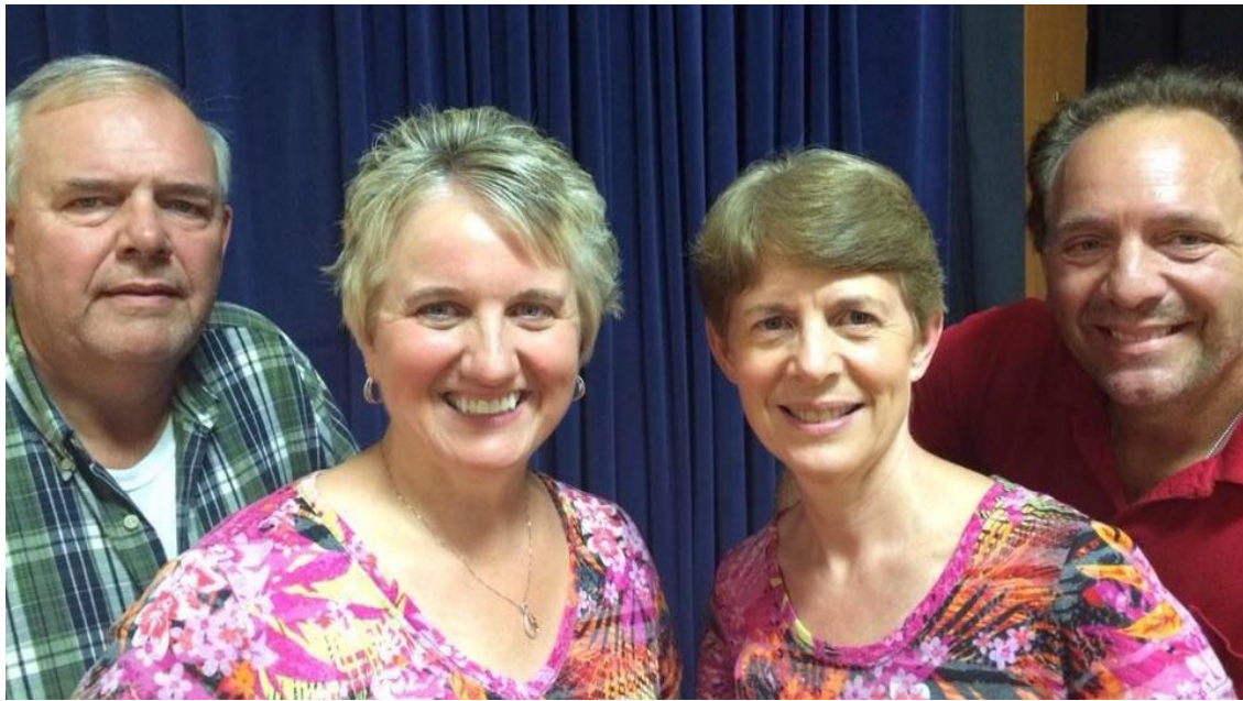
Leather N' Lace Sunday, November 19, 1-5 p.m. Doors open at noon; snacks and bar available. $10 Cover/ $8 for Concordia Members