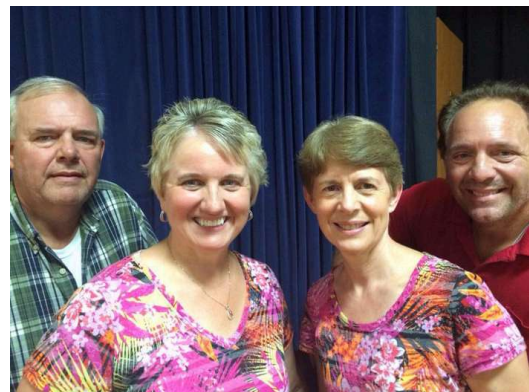
FEBRUARY 22nd Leather N' Lace